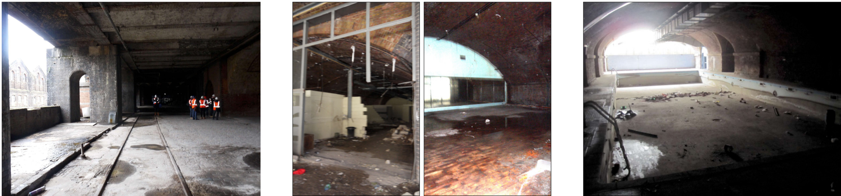
EXAMPLES OF VARIATION IN FLOOR LEVEL AND FINISH - Existing condition to be addressed to enable all units to have level access off London Road.